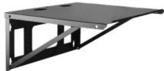
FS Series folds out to open position (requires no assembly, supports up to 100 lbs.)