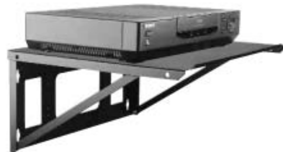
Economical solution for wall mounting audio, video, or computer equipment.

Ships for Less! Stores for Less! Installs for Less!