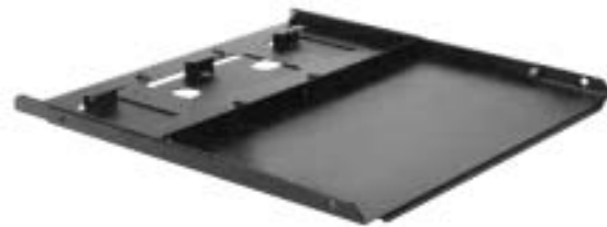
FS Series - ships and stores flat